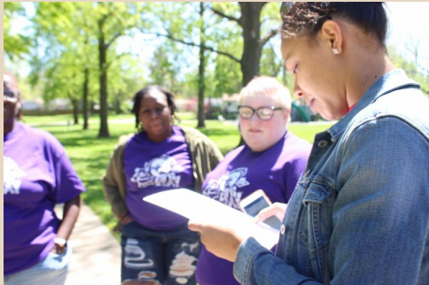
TSM Staff at the TSM sponsored Chamber of Commerce Earth Day Networking Event.

As TSM continues to expand, so does its staffing needs! Open positions include: