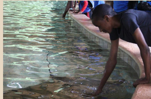
TSM students at the St. Louis Zoo's stingray exhibit.

The ENAL Summer Initiative Program begins June 3! It is an 8 week program full of learning, enrichment activities, and fun field-trips to St. Louis' best attractions. This is our way of cultivating community.